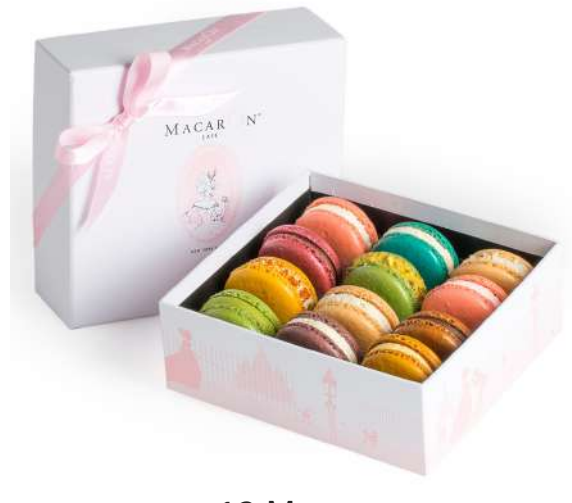
12 Macarons Medium Luxury Gift Box(shippable) $40.00