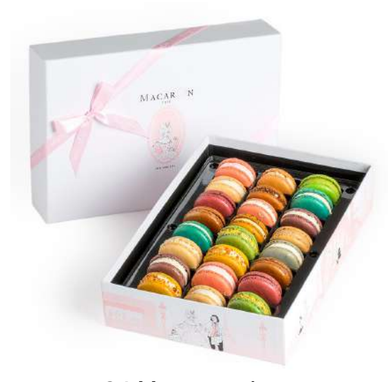
24 Macarons Large Luxury Gift Box (shippable)