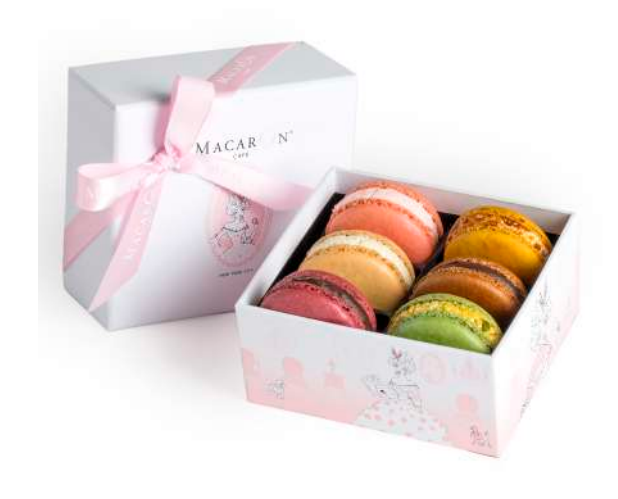
6 Macarons Small Luxury Box (shippable) $23.00